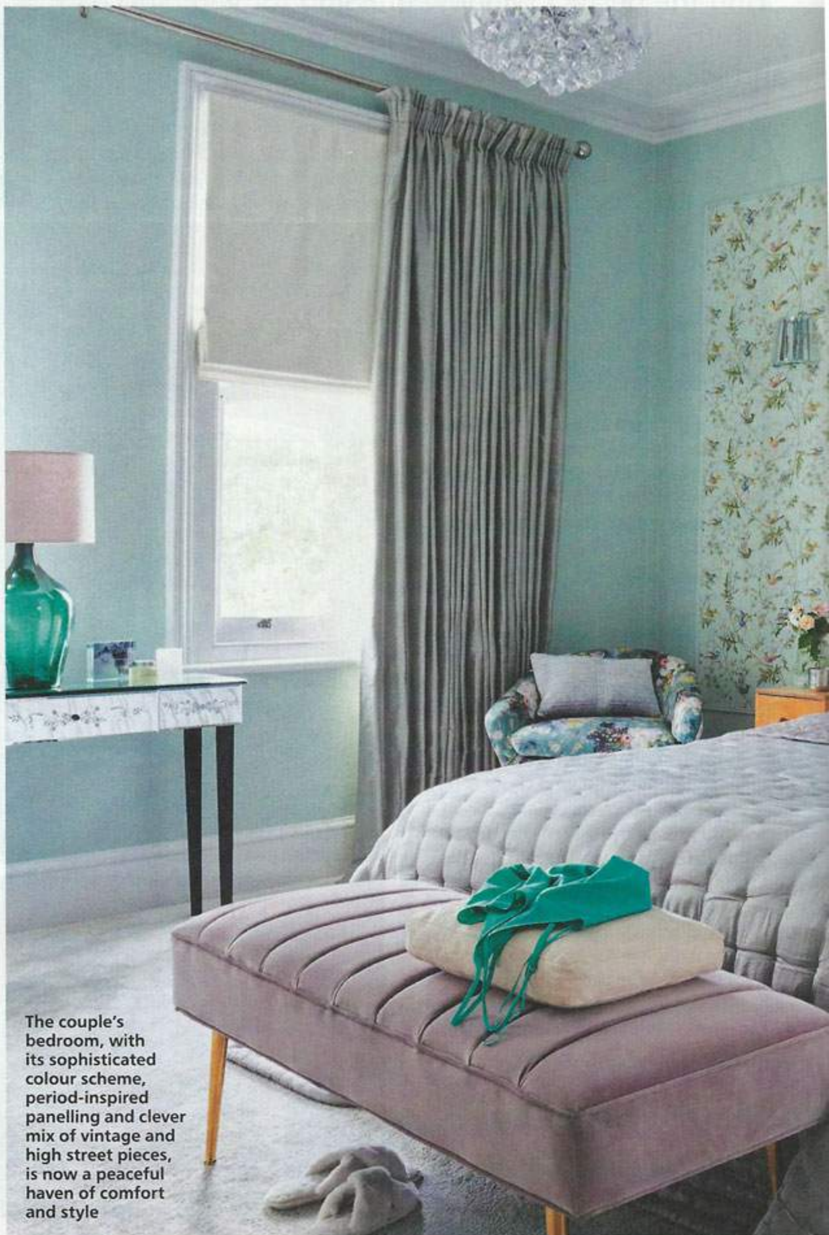
The couple's bedroom, with its sophisticated colour scheme, period-inspired panelling and clever mix of vintage and high street pieces, is now a peaceful haven of comfort and style

STEP TWO With the basics in place, Beverley turned her attention to the décor and, after a lot of deliberation, settled on a pretty printed wallpaper. 'I loved the fresh colour and floral motif, but, as it wasn't