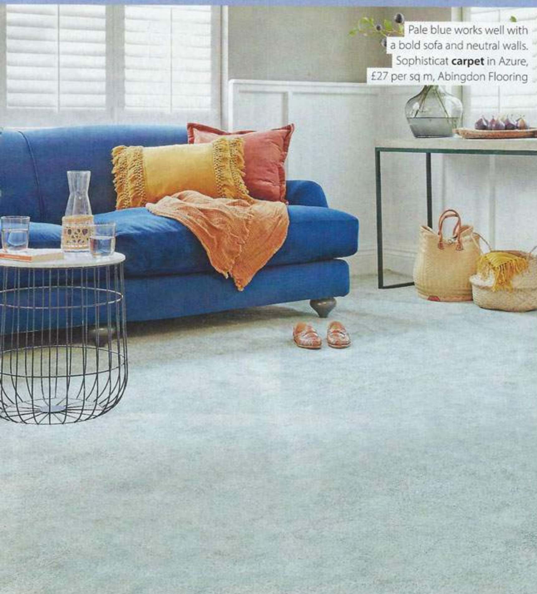
Pale blue works well with a bold sofa and neutral walls. Sophisticat carpet in Azure, £27 per sq m, Abingdon Flooring