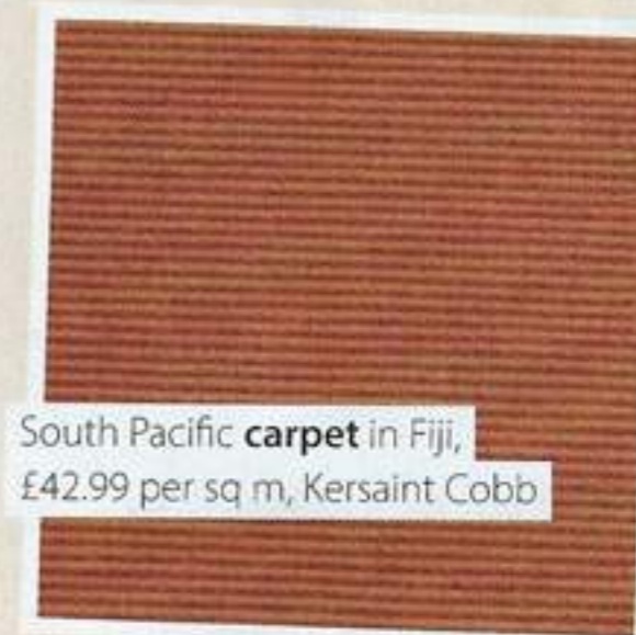
South Pacific carpet in Fiji, £42.99 per sq m, Kersaint Cobb