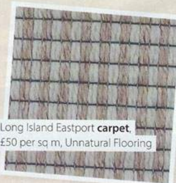
Long Island Eastport carpet , £50 per sq m, Unnatural Flooring