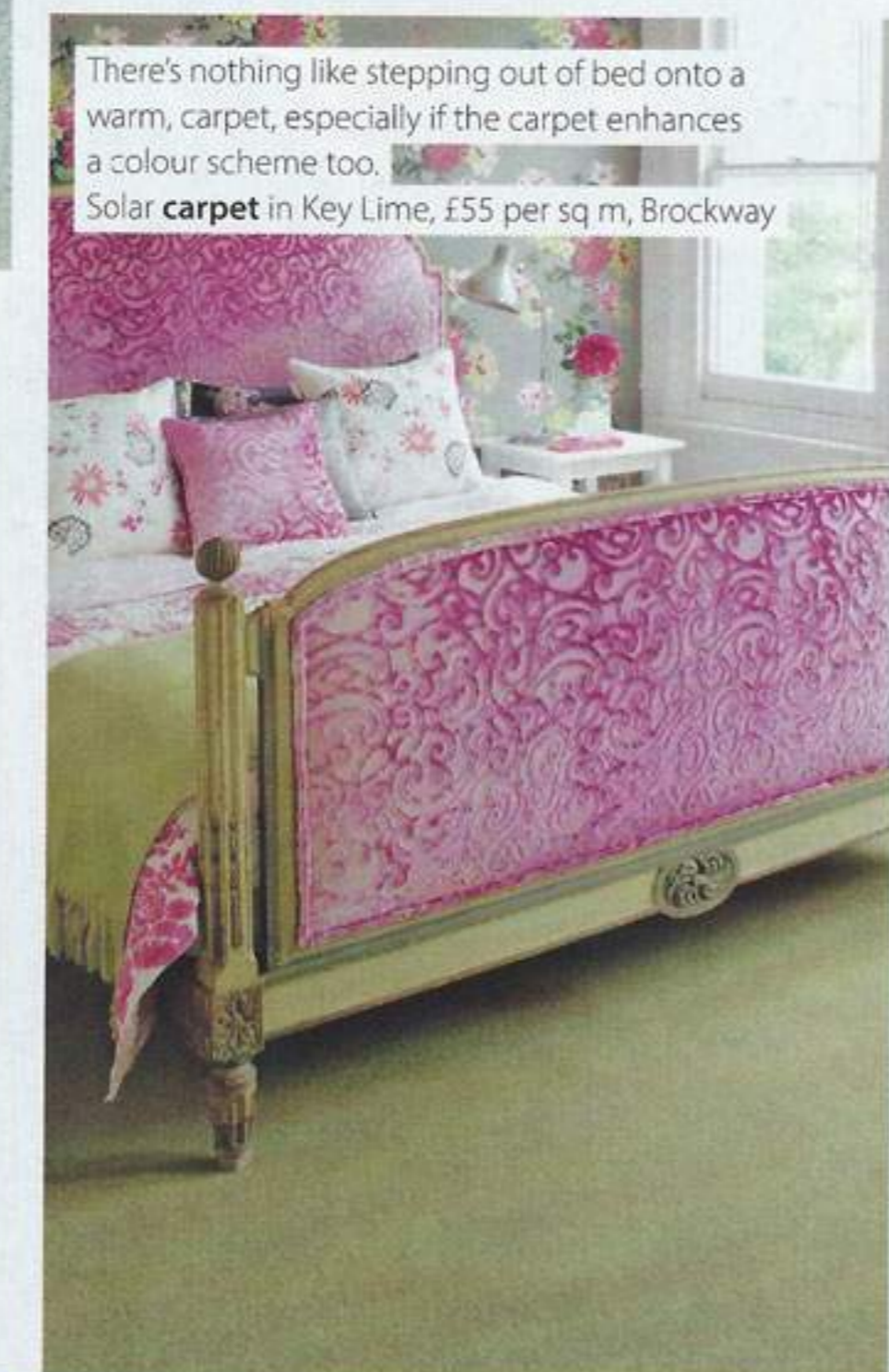
There's nothing like stepping out of bed onto a warm, carpet, especially if the carpet enhances a colour scheme too. Solar carpet in Key Lime, £55 per sq m, Brockway