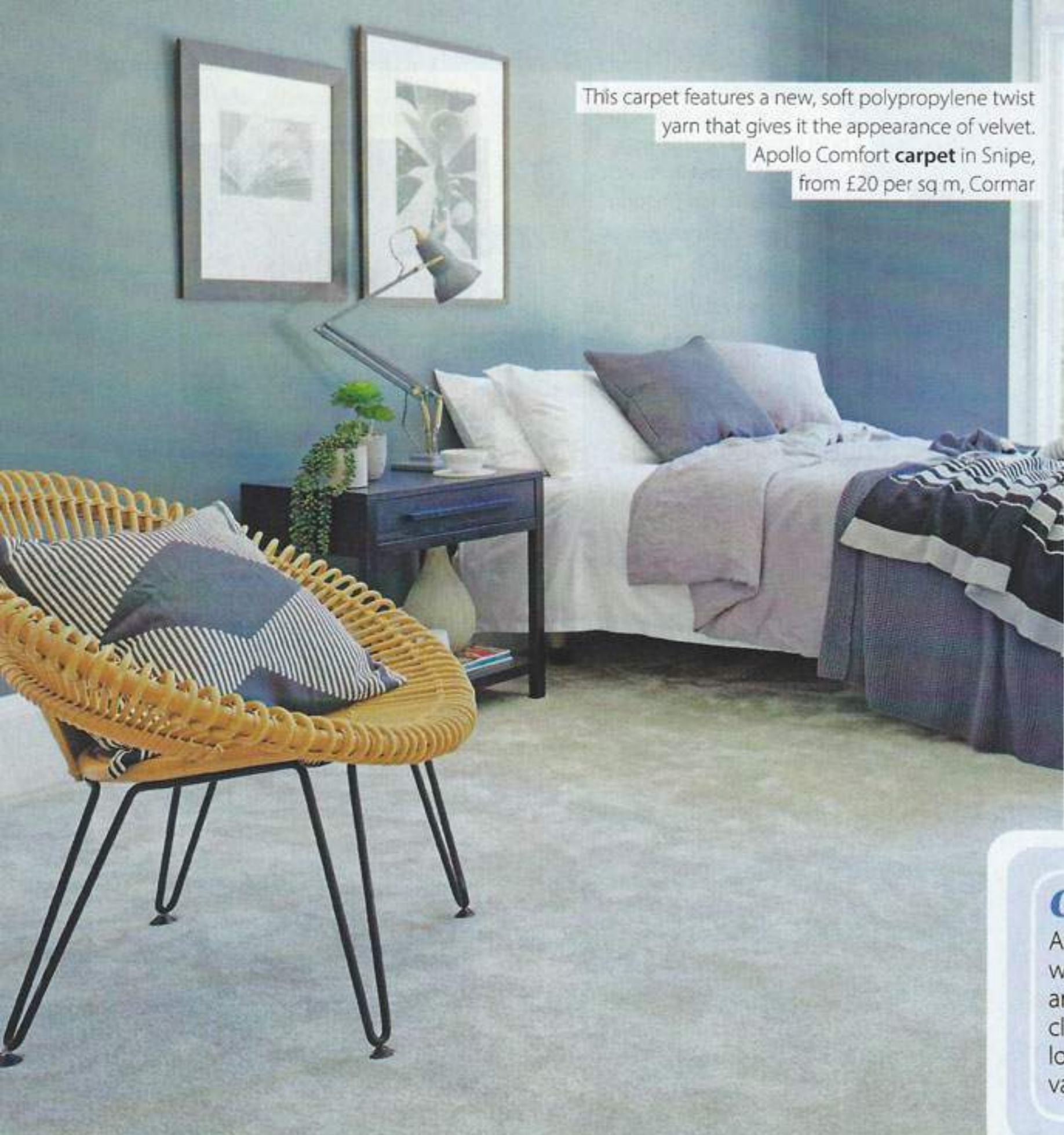
This carpet features a new, soft polypropylene twist yarn that gives it the appearance of velvet. Apollo Comfort carpet in Snipe, from £20 per sq m, Cormar