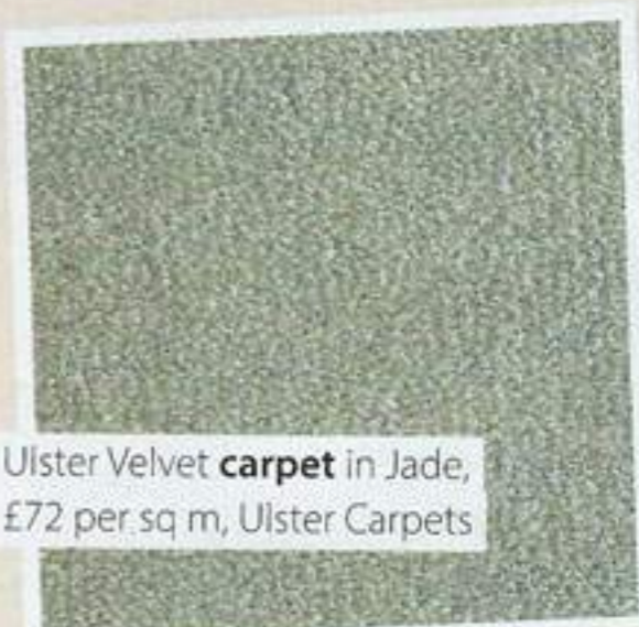
Ulster Velvet carpet in Jade, £72 per sq m, Ulster Carpets