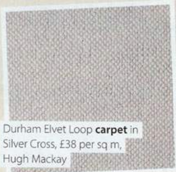
Durham Elvet Loop carpet in Silver Cross, £38 per sq m, Hugh Mackay