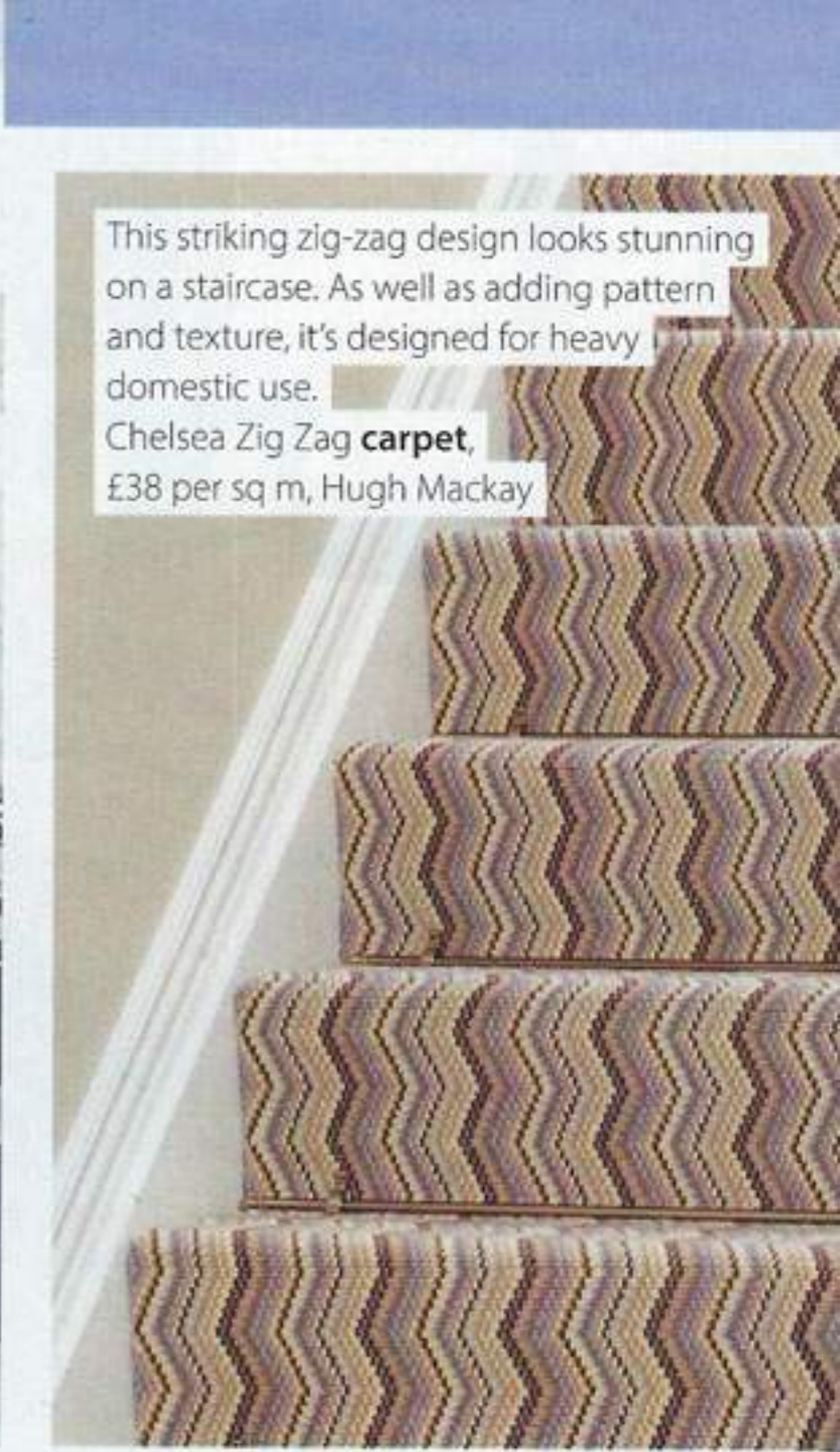
This striking zig-zag design looks stunning on a staircase. As well as adding pattern and texture, it's designed for heavy domestic use. Chelsea Zig Zag carpet , £38 per sq m, Hugh Mackay