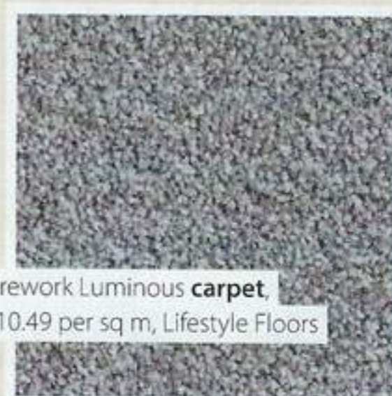
Firework Luminous carpet , £10.49 per sq m, Lifestyle Floors