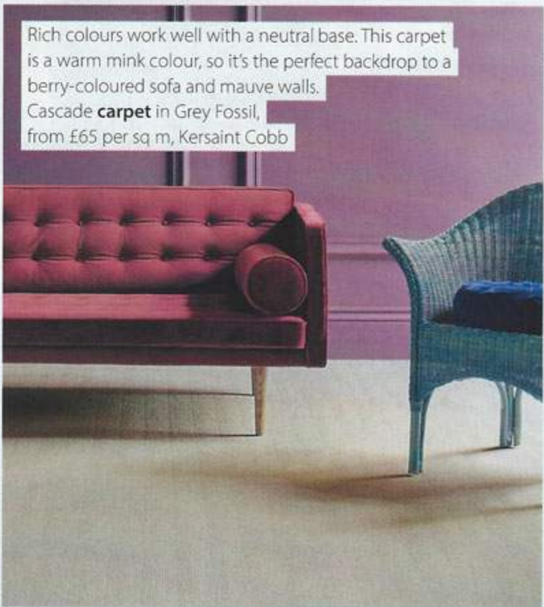
Rich colours work well with a neutral base. This carpet is a warm mink colour, so it's the perfect backdrop to a berry-coloured sofa and mauve walls. Cascade carpet in Grey Fossil, from £65 per sq m, Kersaint Cobb