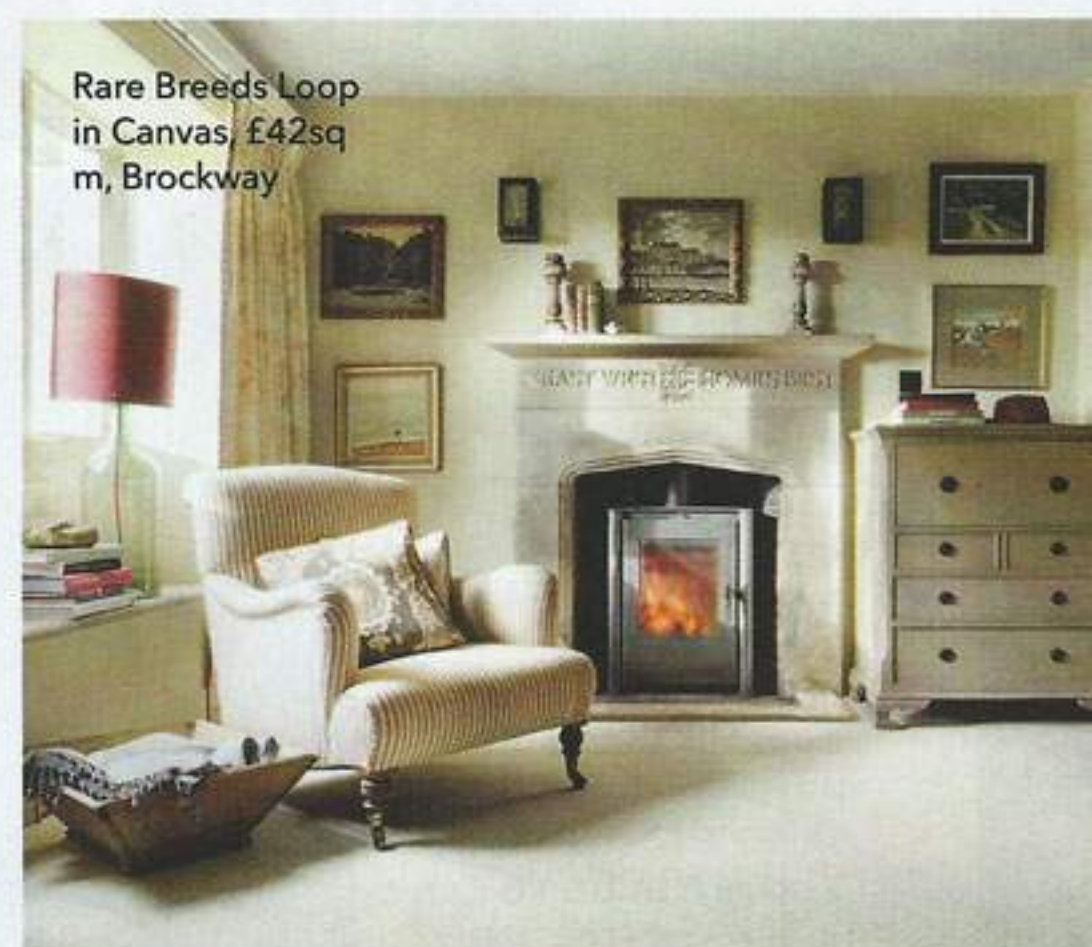
Rare Breeds Loop in Canvas, £42sq m, Brockway