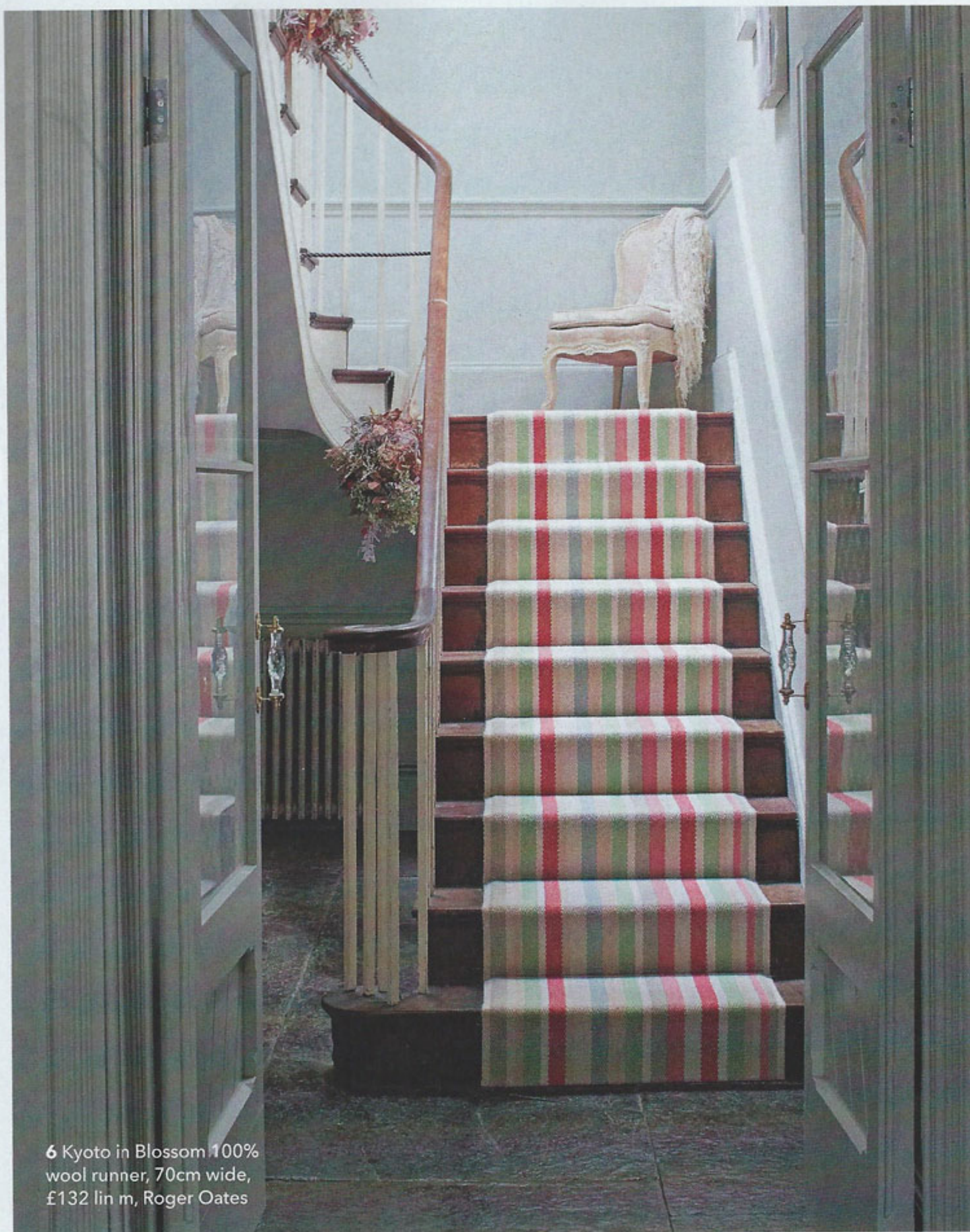
6 Kyoto in Blossom 100% wool runner, 70cm wide, £132 lin m, Roger Oates

Nothing sets the tone of a home more than a suitably stylish entrance. The wonderful thing about this striped flatweave runner from Roger Oates is that it not only oozes style, but its joyful pastel colour combination offers a cheerful welcome to everyone that crosses the threshold. What's more, these stylish runners are crafted using traditional techniques on Hattersley looms using a British Cheviot wool blend, which is spun and dyed in Yorkshire.