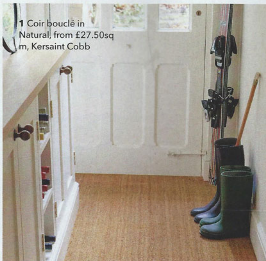
1 Coir bouclé in Natural, from £27.50sq m, Kersaint Cobb