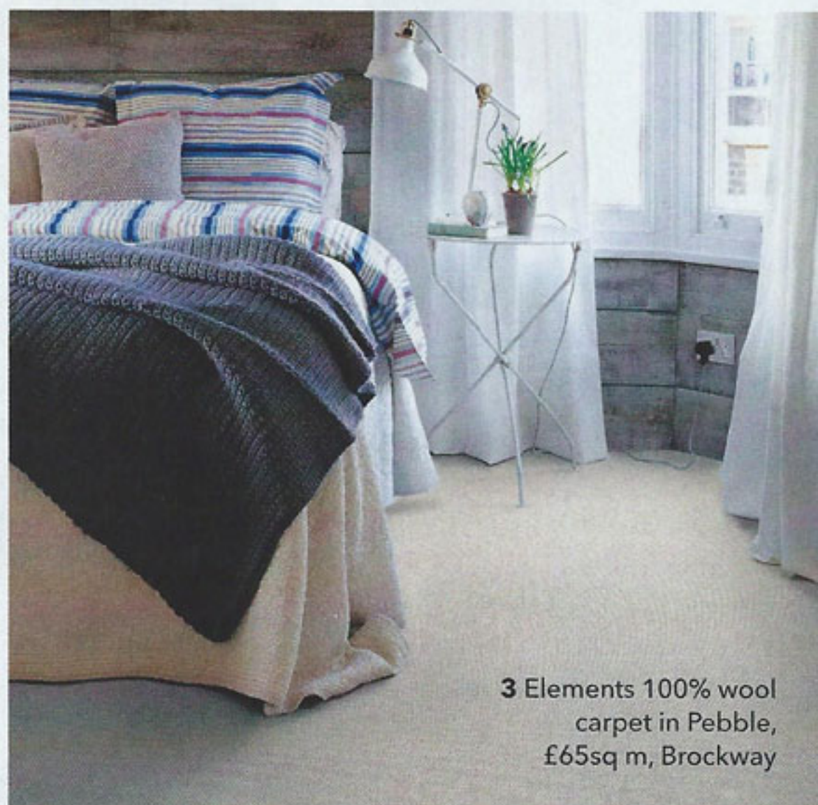
3 Elements 100% wool carpet in Pebble, £65sq m, Brockway