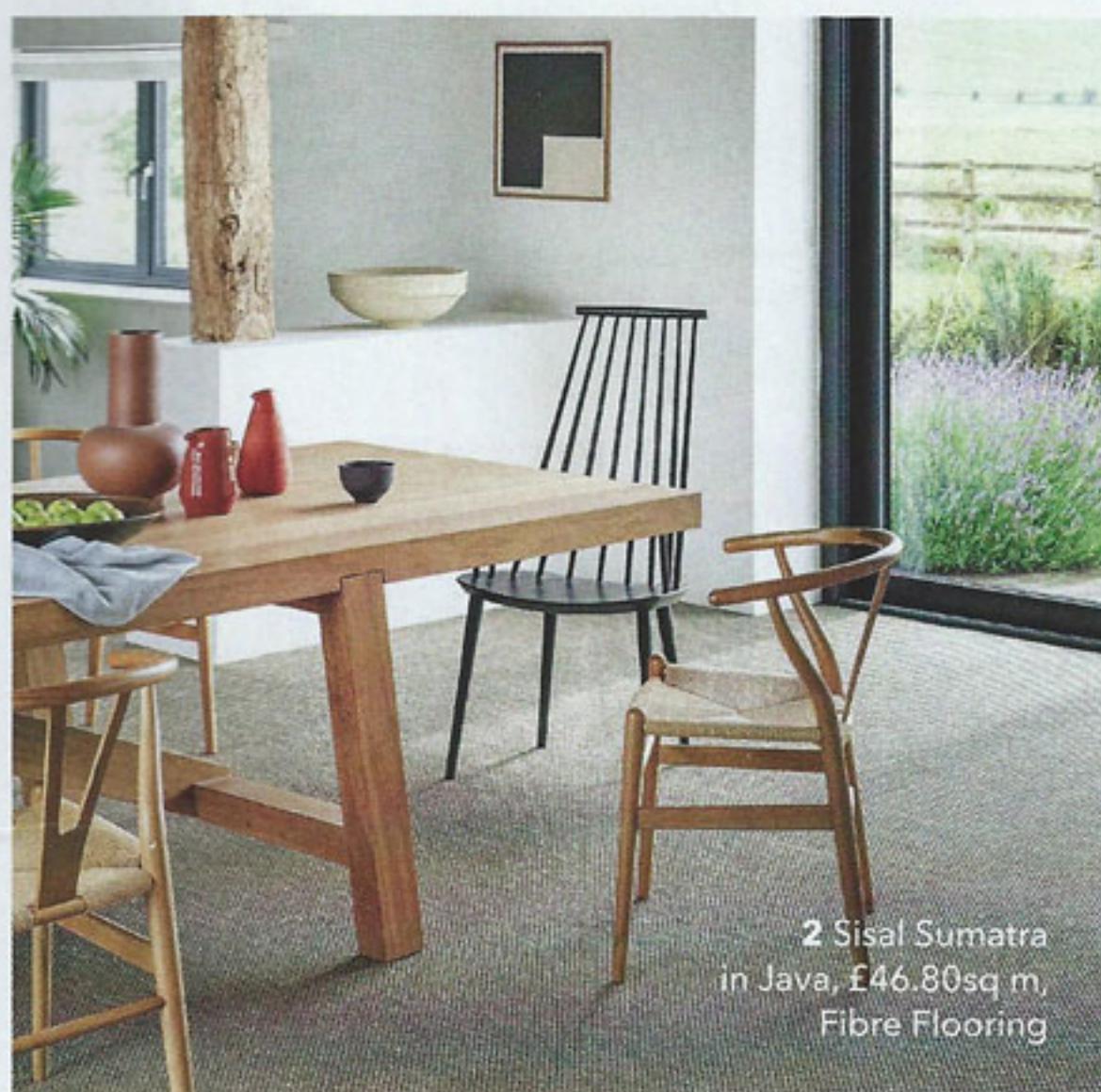
2 Sisal Sumatra in Java, £46.80sq m, Fibre Flooring