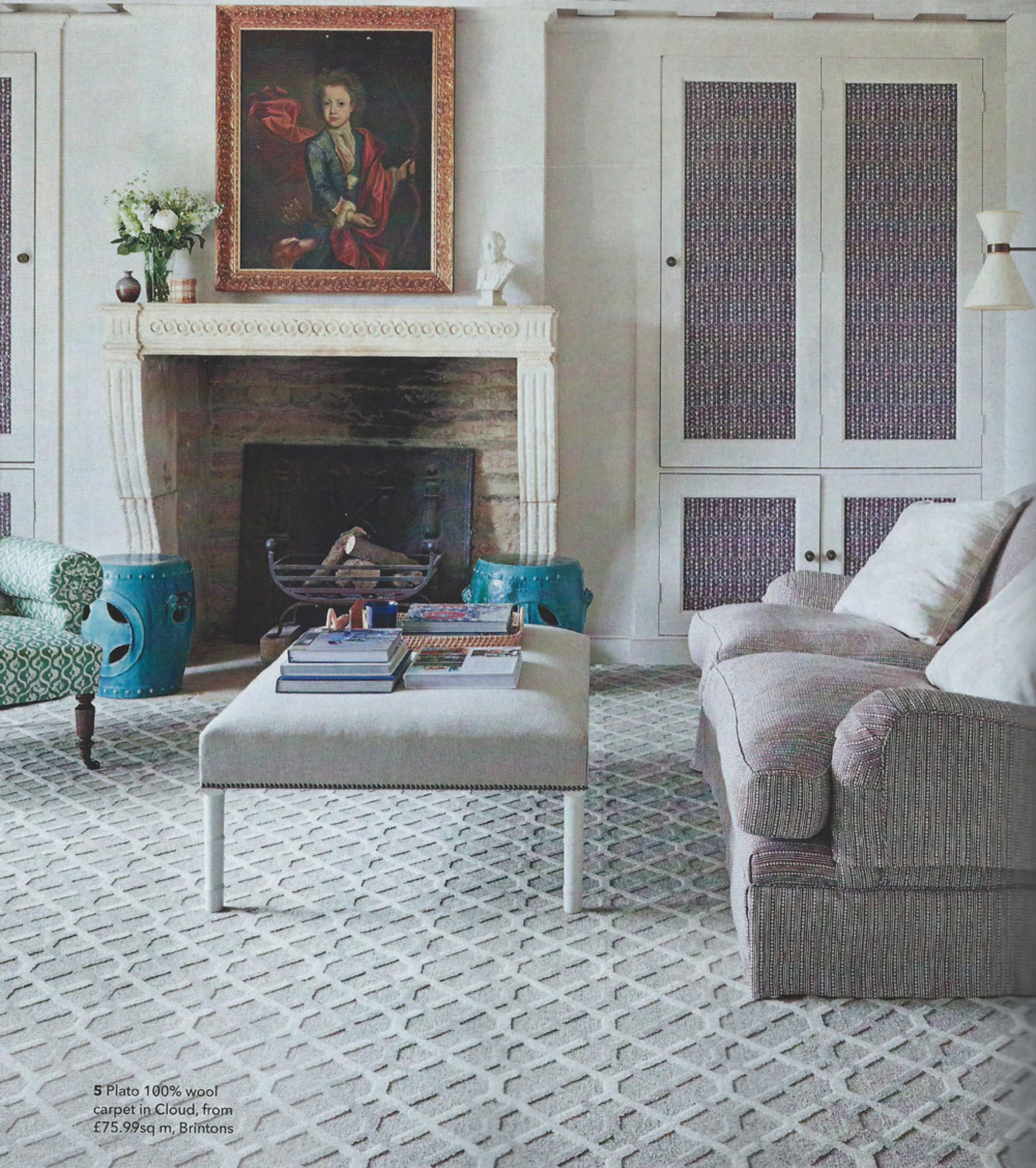
5 Plato 100% wool carpet in Cloud, from £75.99sq m, Brintons